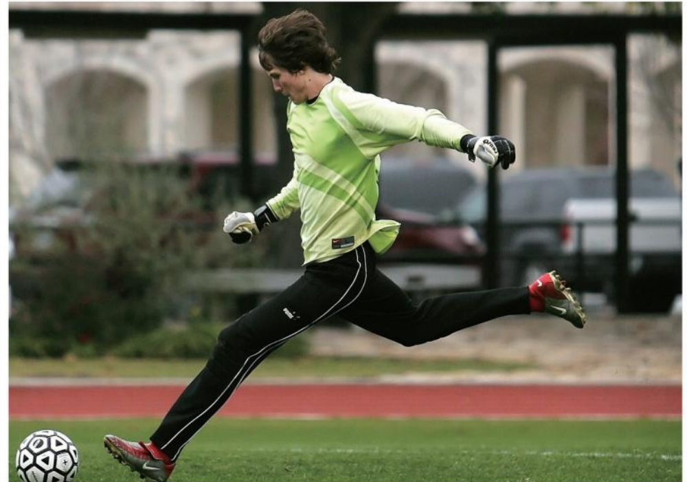
# Olive/ Black