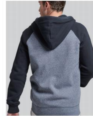
#Navy melange/ Black