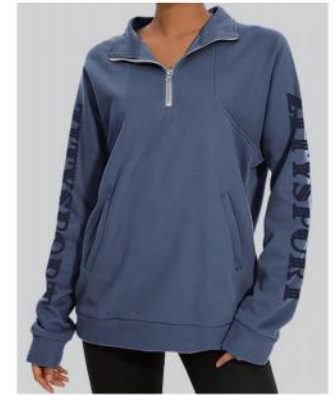
# Future Blue