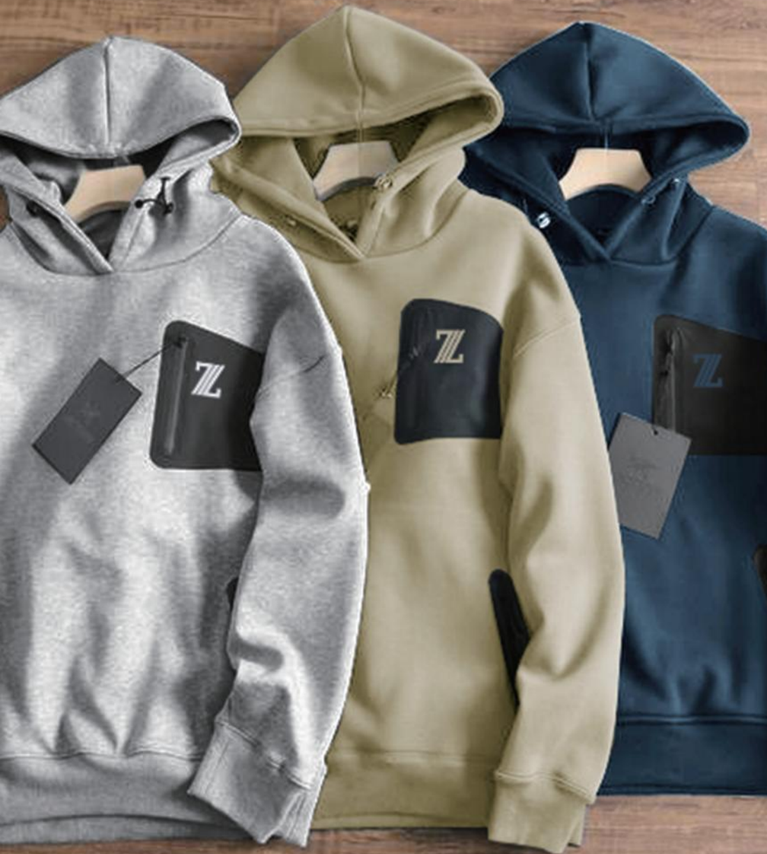
Blend Grey/Stone Khak/Sea Blue