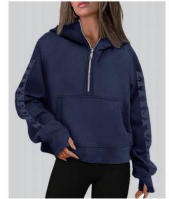
# Future Blue