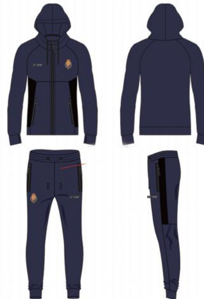
# Navy/ Black