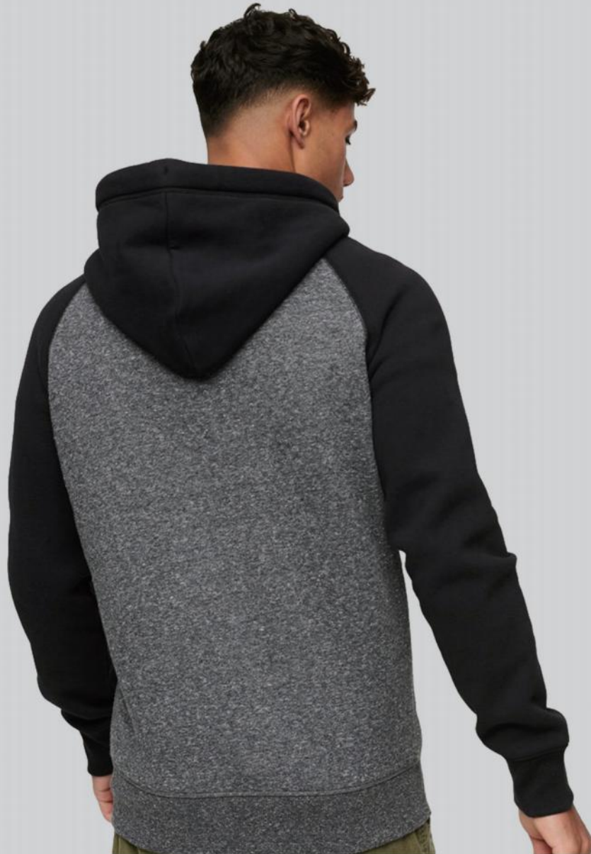
#Grey melange / Black