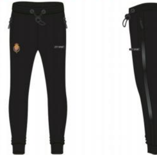
# Orange/ Black