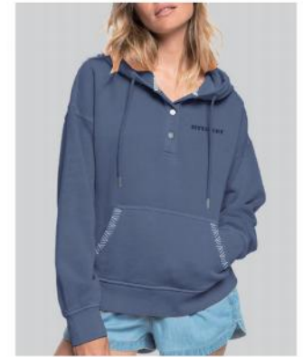
# Future Blue